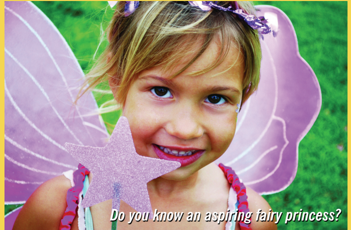
Do you know an aspiring fairy princess?

end of the semester, they'll enjoy the ultimate excitement of performing onstage, in front of a live audience. Don't let your child miss this opportunity to explore the world of their imagination, guided by seasoned theatre professionals. Classes fill early, so register now!